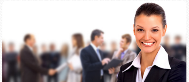
Security Human Resources Consultancy Services