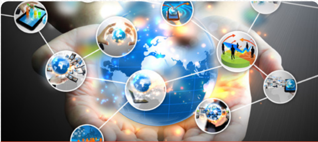
Information and Intelligence Sharing Services