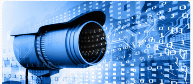
Consultancy for Security Equipment