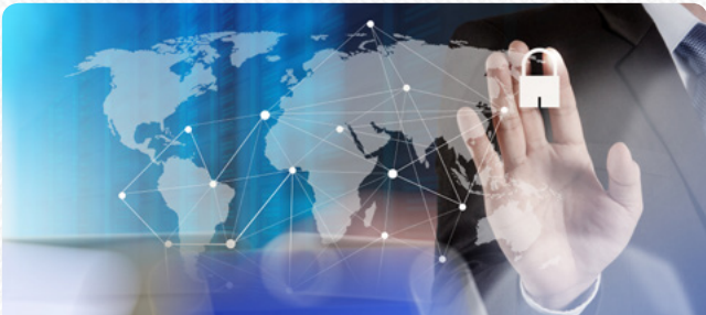
Security Risk and Threat Assessment